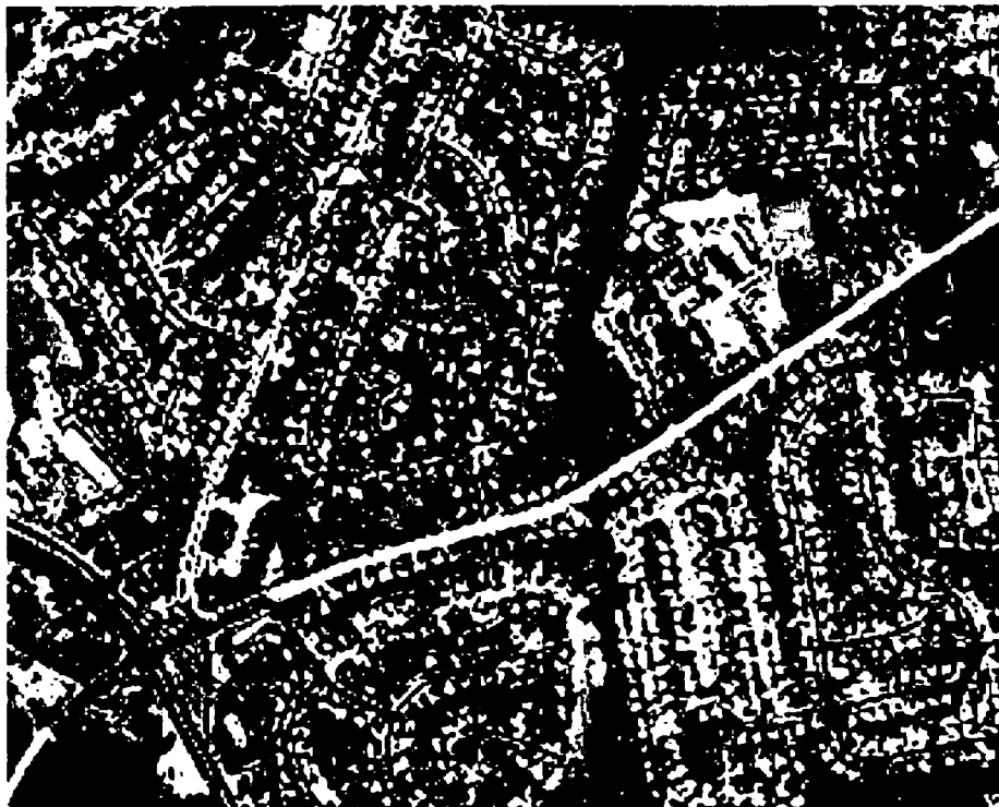
Sprawl: a bird's eye view. A digitally enhanced aerial photo of New Castle County, Delaware vividly demonstrates how roads and houses (white) can divide up features of the landscape.

And critics note that Phoenix, one of the fastest growing cities in the country, is moving into the desert at a rate of 1 acre per hour (prompting the comment: "the only thing stopping Phoenix is Tucson.") 4